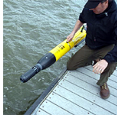
Launch of EcoMapper AUV in cooling reservoir

*Please note that the mention of the USGS in the above article does not imply its specific endorsement of this YSI product.